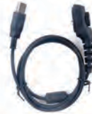
Programming Cable (USB Port) PC38