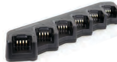
MCU Multi-Unit Charger (For Thick Battery) MCA08