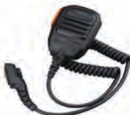
Remote Speaker Microphone (IP57) SM18N2