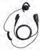
Earset Swivel EHN17