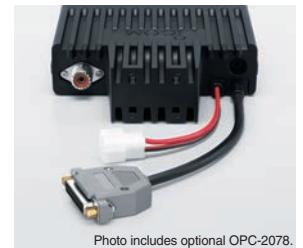
Photo includes optional OPC-2078.

* No digital modulation "IN" using accessory cables.