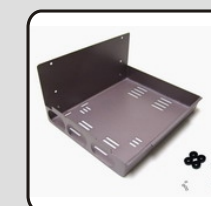
External Duplexer Installation Kit BRK06