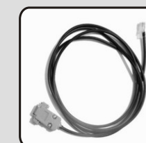
Transmitter Programming Cable Pc14