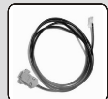
Receiver Programming Cable Pc15