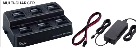
▲ BC-121N+AD-106 (6 pcs.)